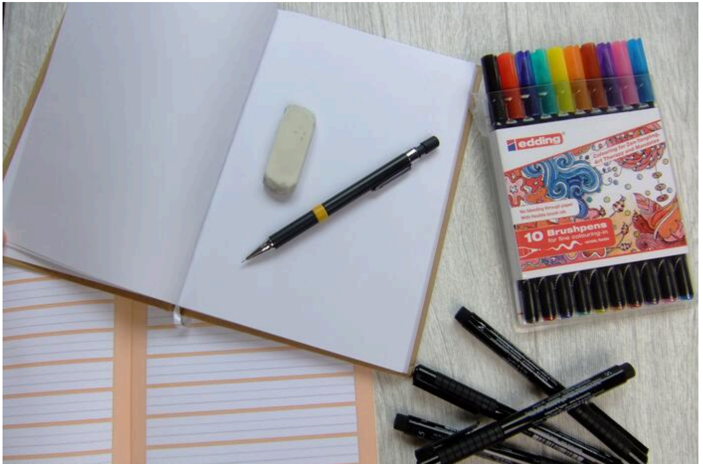
Hand Lettering - Erstaussstattung

You will also need a brush pen for brush lettering. We recommend the brush pens from edding . They are of high quality and do not fray. Don't forget: Choice of paper is important! Start with a learning notebook (ruler size 1) and a papier-mâché notebook for sketches.