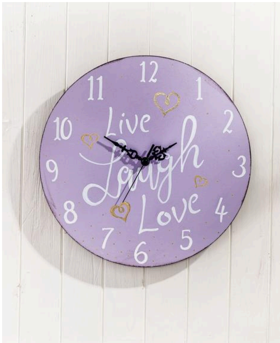
On small furniture