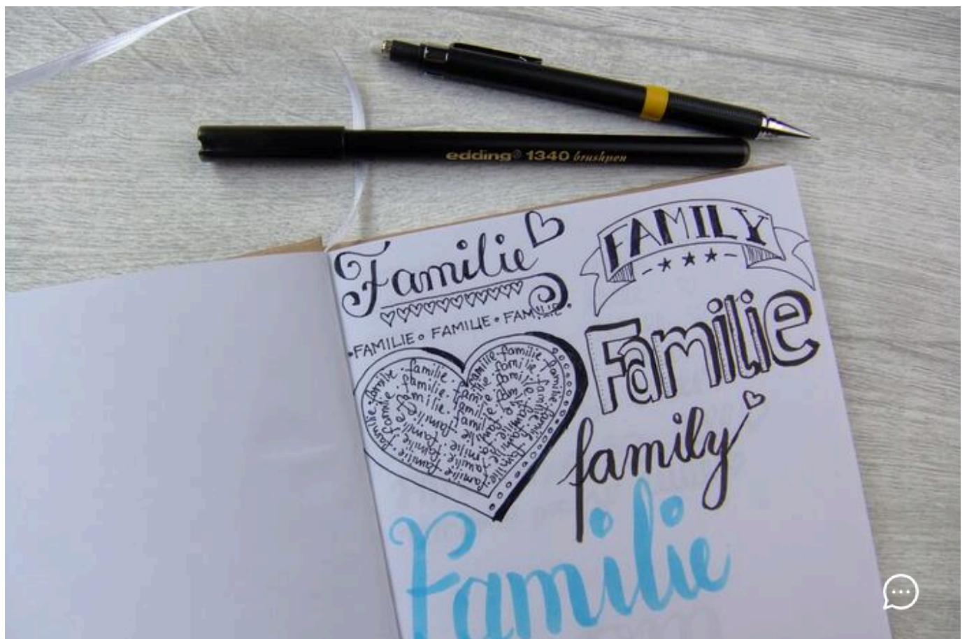
Hand Lettering - Schreibübungen Familie

One method for collecting fonts and design ideas is to write down different designs of a word in your notebook. Experiment with different pens. Remember: practice makes perfect!