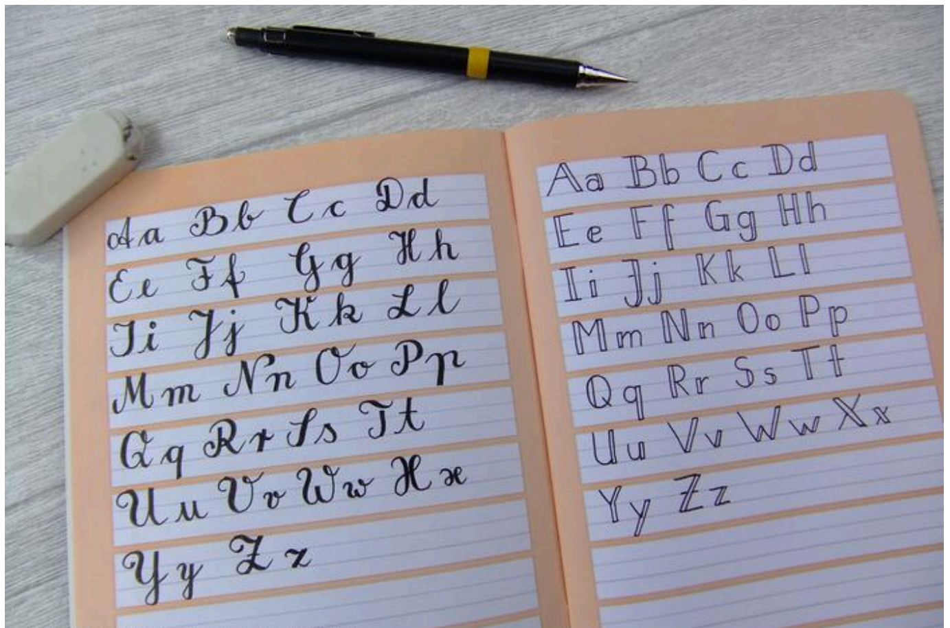
Hand Lettering - Schreibübungen Buchstaben

One method for collecting fonts and design ideas is to write down different designs of a word in your notebook. Experiment with different pens. Remember: practice makes perfect!