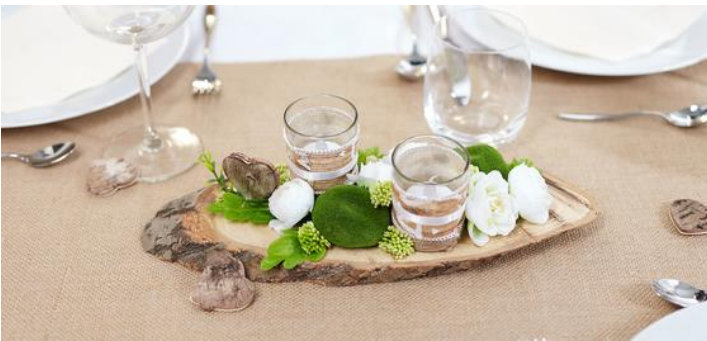
Table arrangement on tree disc

Cover the tealights with double-sided Adhesive tape with a decorative ribbon : a festive ribbon and classic white Satin ribbon. Natural-coloured Yarn harmonise perfectly with it. Wrap the lower part with string, Adhesive tape also helps to fix it in place