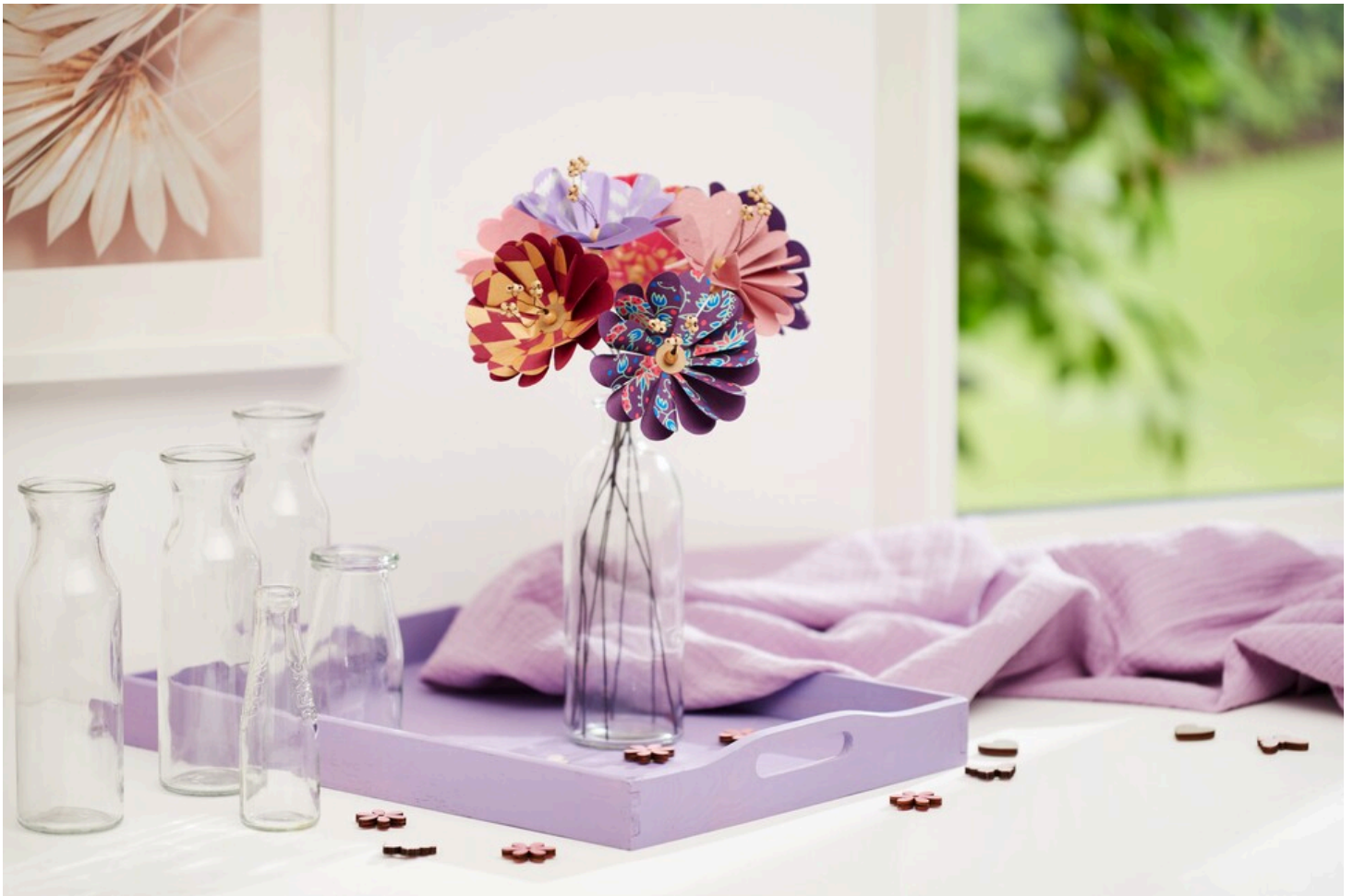
Elegant flowers made from natural paper and beads: a DIY-tutorial

Crafting makes you happy - especially when the creative process results in a decorative flower that brightens up your home. These instructions will show you how to easily make elegant flowers from natural paper and beads yourself. Let yourself be inspired and discover how easy it is to create small works of art in just a few simple steps!